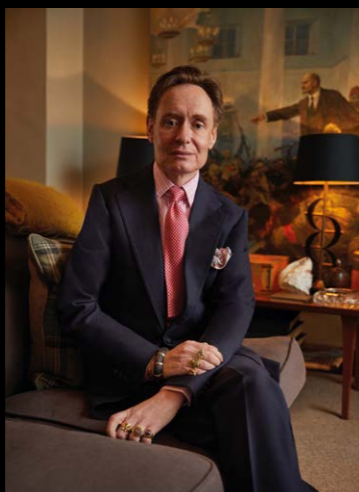
Nicholas Foulkes Historian, author of the books « Patek Philippe, the Authorized biography » and « Time Tamed, the remarkable Story of humanity's Quest to Measure Time » editor-in-chief of Vanity Fair On Time.

However, if it is an early Patek Philippe chronograph you are searching for then this sale also features an exquisite Ref 130 with Breguet numerals in the desirable combination of salmon dial and steel case, as well as an interesting pair of Ref 1463s. Introduced in 1940 and known in Italian collector circles by the sobriquet Tasti Tondi, the 1463 is a true pillar of modern period Patek Philippe and remained in production for a quarter of a century. The two watches presented here include one with baton indices; and a second example with Breguet