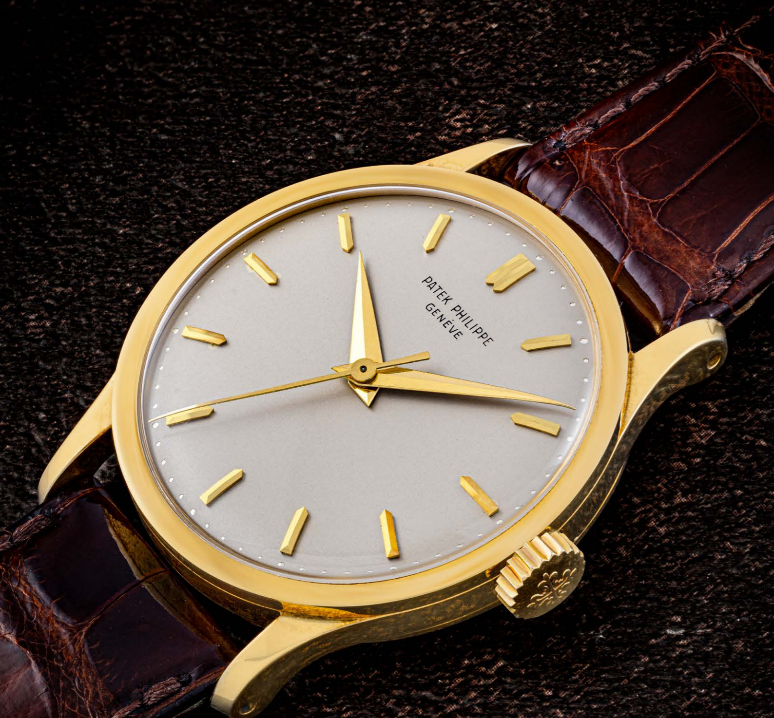
Ψ 2311 PATEK PHILIPPE. AN 18K GOLD WRISTWATCH WITH SWEEP CENTRE SECONDS REF. 570, MANUFACTURED IN 1958

Movement: Manual Dial: Silvered Case: 35 mm. With: 18k gold Patek Philippe buckle and Patek Philippe Extract from the Archives Remark: Fresh to the market Note: Serial numbers are available upon request