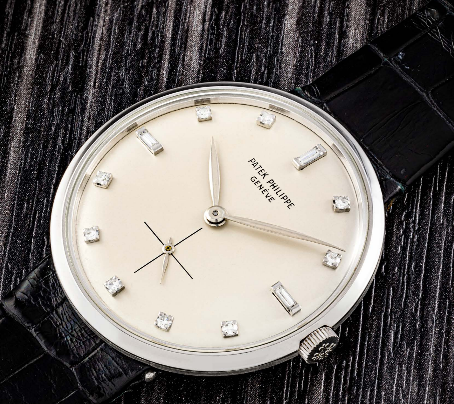
Ψ 2318 PATEK PHILIPPE. A VERY RARE PLATINUM AND DIAMOND-SET WRISTWATCH REF. 2591/1, MANUFACTURED IN 1961

Movement: Manual Dial: Silvered with diamond-set Case: 34 mm. With: Platinum Patek Philippe buckle and Patek Philippe Extract from the Archives Remark: Fresh to the market, only 2 known platinum examples with subsidiary seconds Note: Serial numbers are available upon request