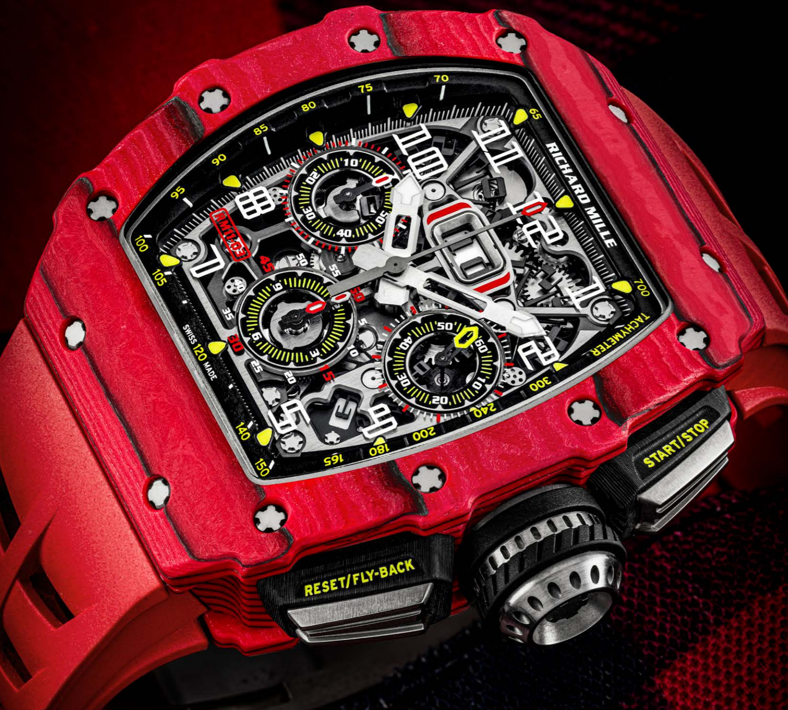
2280 RICHARD MILLE. A RED QUARTZ-TPT® AUTOMATIC SEMI-SKELETONISED FLYBACK CHRONOGRAPH WRISTWATCH WITH ANNUAL CALENDAR REF. RM11-03, CIRCA 2017

Movement: Automatic Dial: Semi-skeletonised Case: 42 x 50 mm. (W x H) With: Titanium Richard Mille deployant clasp, Richard Mille Warranty, Richard Mille-repair invoice, presentation box and outer packaging Note: Serial numbers are available upon request