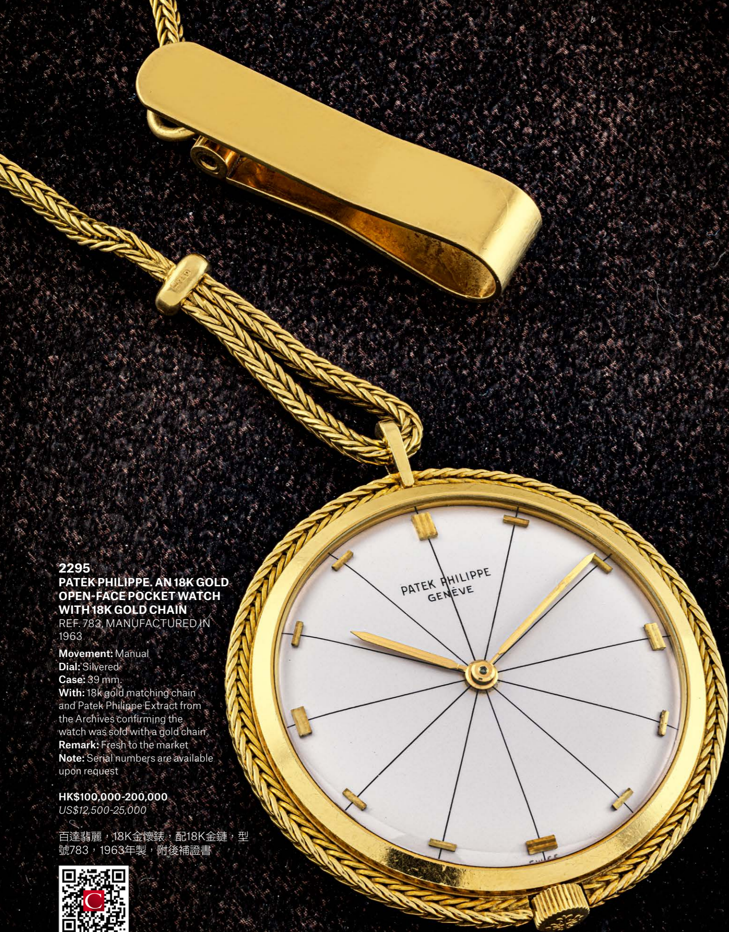
2295 PATEK PHILIPPE. AN 18K GOLD OPEN-FACE POCKET WATCH WITH 18K GOLD CHAIN REF. 783, MANUFACTURED IN 1963

Movement: Manual Dial: Silvered Case: 39 mm. With: 18k gold matching chain and Patek Philippe Extract from the Archives confirming the watch was sold with a gold chain. Remark: Fresh to the market Note: Serial numbers are available upon request