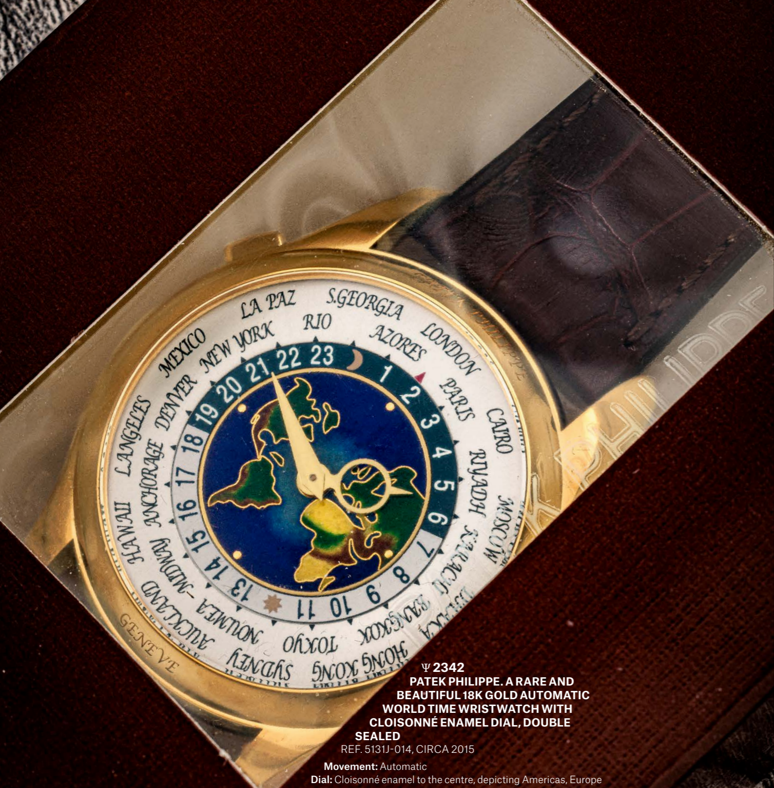
Ψ 2342 PATEK PHILIPPE. A RARE AND BEAUTIFUL 18K GOLD AUTOMATIC WORLD TIME WRISTWATCH WITH CLOISONNÉ ENAMEL DIAL, DOUBLE SEALED REF. 5131J-014, CIRCA 2015

Movement: Automatic Dial: Cloisonné enamel to the centre, depicting Americas, Europe and Africa Case: 39.5 mm. With: 18k gold Patek Philippe buckle, Patek Philippe Certificate of Origin, product literature, leather holder, presentation box and outer packaging Remark: Fresh to the market Note: Serial numbers are available upon request