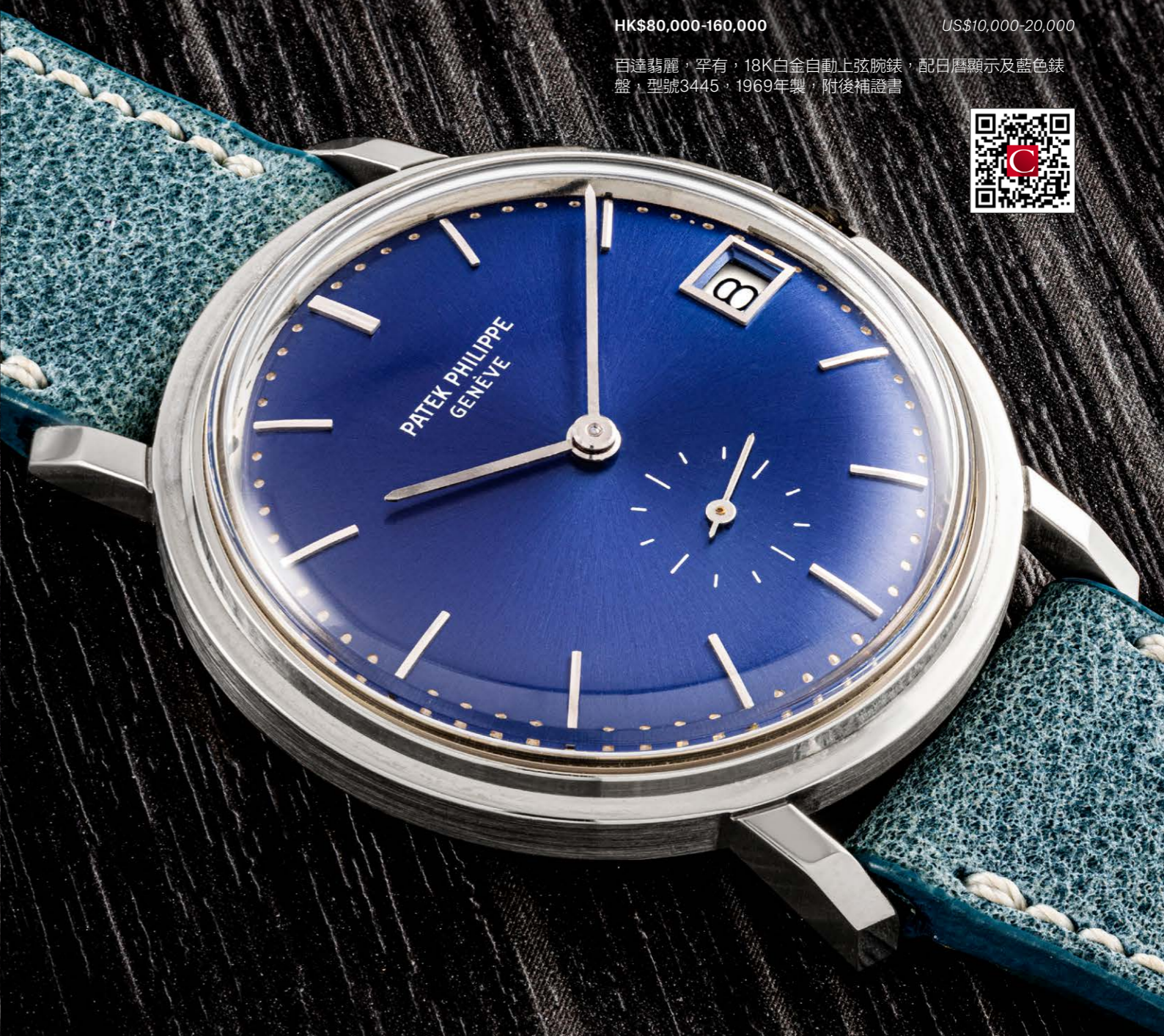
2319 PATEK PHILIPPE. A RARE 18K WHITE GOLD AUTOMATIC WRISTWATCH WITH DATE AND BLUE DIAL REF. 3445, MANUFACTURED IN 1969

Movement: Automatic Dial: Sunburst metallic blue, "Sigma" to the bottom of the dial Case: 35 mm. With: 18k white gold buckle and Patek Philippe Extract from the Archives confirming the sunburst metallic blue dial Remark: Appears to be a later service dial Note: Serial numbers are available upon request