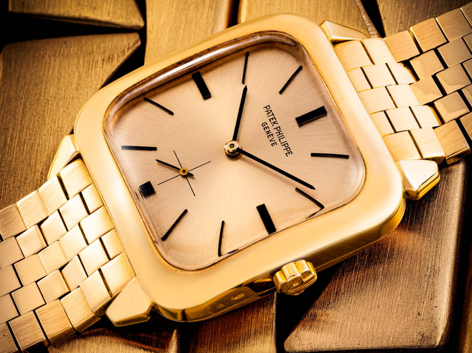
2324 PATEK PHILIPPE. A VERY RARE 18K PINK GOLD AUTOMATIC SQUARE WRISTWATCH WITH PINK DIAL, BLACK INDEXES AND BRACELET REF. 2540, RETAILED BY SERPICO & LAINO, MANUFACTURED IN 1956

Movement: Automatic Dial: Pink Case: 31.5 mm. wide With: 18k pink gold Patek Philippe bracelet, overall length approximately 175 mm. and Patek Philippe Extract from the Archives confirming the present watch comes with a pink gold bracelet Remark: Fresh to the market, the first square shaped automatic reference. Dial appears to be a later service dial Note: Serial numbers are available upon request