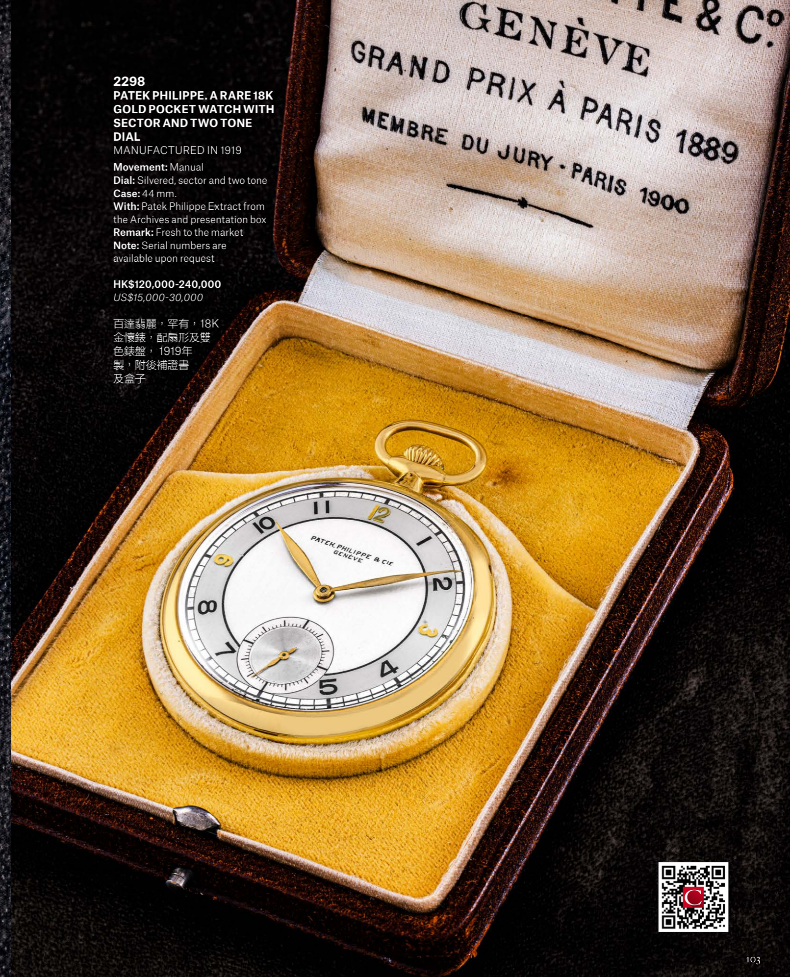
2298 PATEK PHILIPPE. A RARE 18K GOLD POCKET WATCH WITH SECTOR AND TWO TONE DIAL

百達翡麗，罕有，18K金懷錶，配扇形及雙色 錶盤，1933年製，附後補證書及盒子