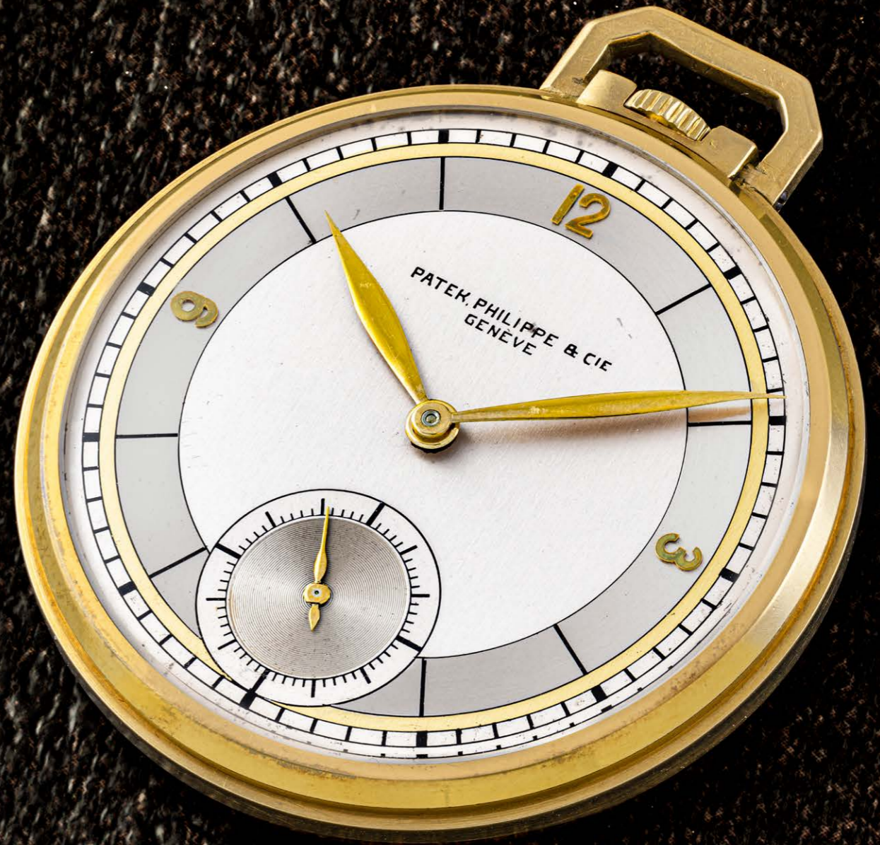
2296 PATEK PHILIPPE. A RARE 18K GOLD POCKET WATCH WITH THREE TONE DIAL REF. 600, MANUFACTURED IN 1929

Movement: Manual Dial: Three tone dial Case: 44 mm. With: Patek Philippe Extract from the Archives, Guarantee issued by retailer Grauwiler-Guggenbühl Basel and presentation box Remark: Fresh to the market Note: Serial numbers are available upon request