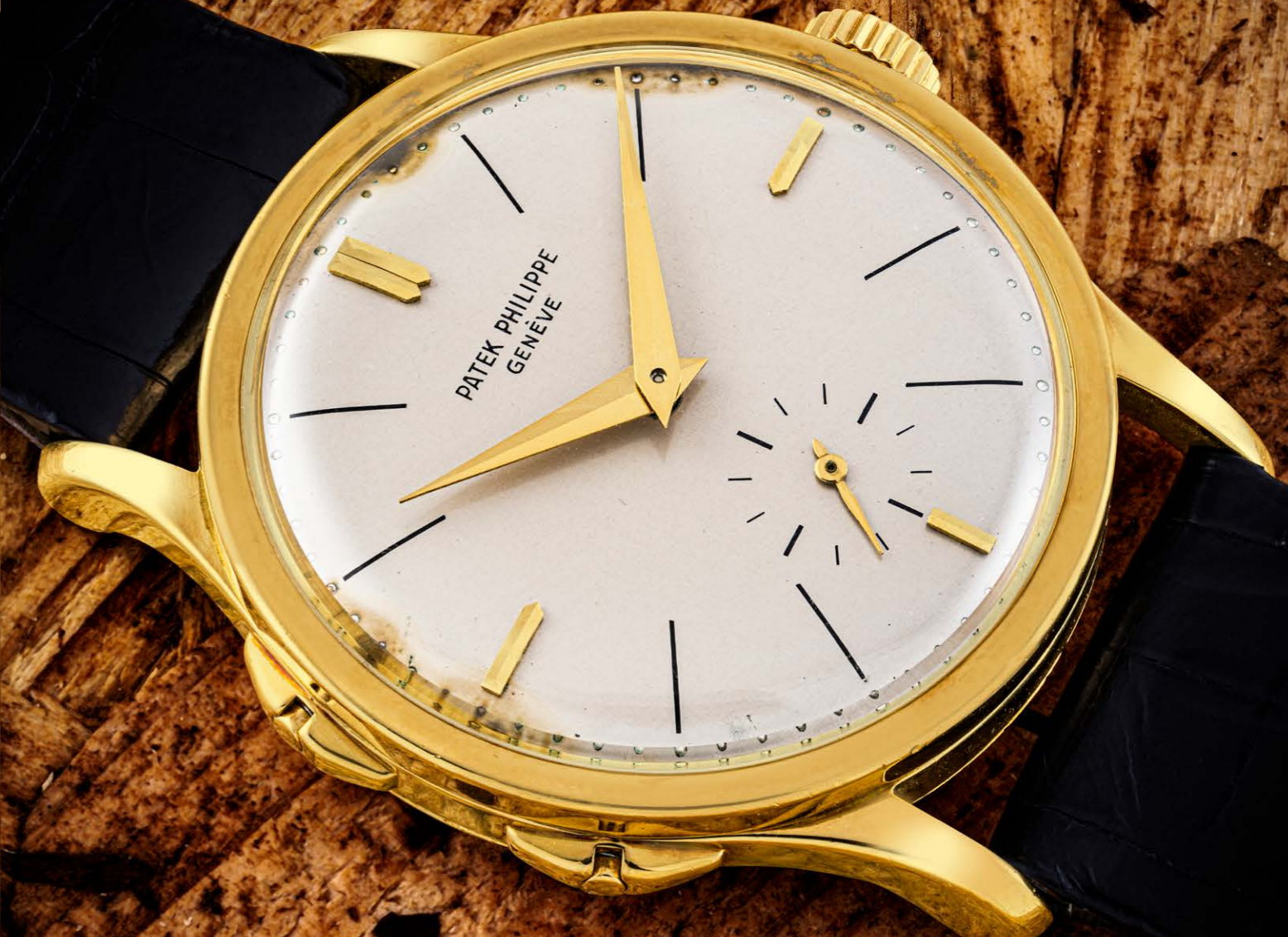
Ψ 2325 PATEK PHILIPPE. A VERY RARE 18K GOLD WRISTWATCH WITH ADJUSTABLE HOUR HAND REF. 2597 FIRST SERIES, MANUFACTURED IN 1956

Movement: Manual Dial: Silvered Case: 35 mm. With: Patek Philippe Extract from the Archives Note: Serial numbers are available upon request