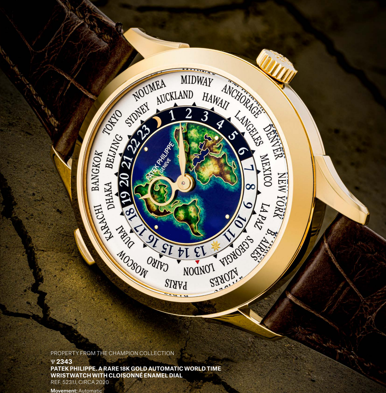
PROPERTY FROM THE CHAMPION COLLECTION Ψ 2343 PATEK PHILIPPE. A RARE 18K GOLD AUTOMATIC WORLD TIME WRISTWATCH WITH CLOISONNÉ ENAMEL DIAL REF. 5231J, CIRCA 2020

百達翡麗，罕有及美麗，18K金世界時間自動上弦腕錶，配搭絲琺瑯錶盤，型號5131J-014，約2015年製，雙封，附原廠證書、盒子及外包裝